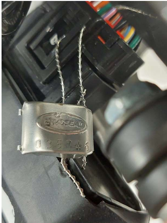
Seal connector ECU