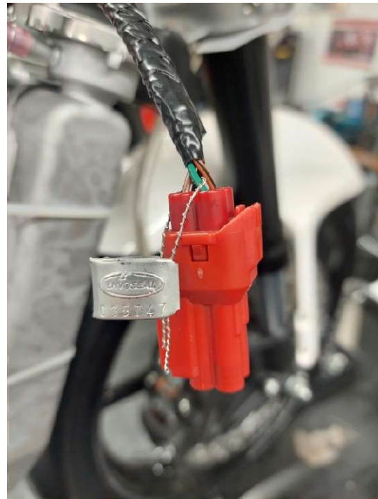
Seal diagnostic plug