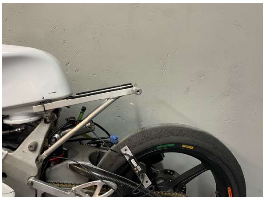
Standard rear sub-frame

Adaptations for taller riders allowed in the sub-frame & tail: