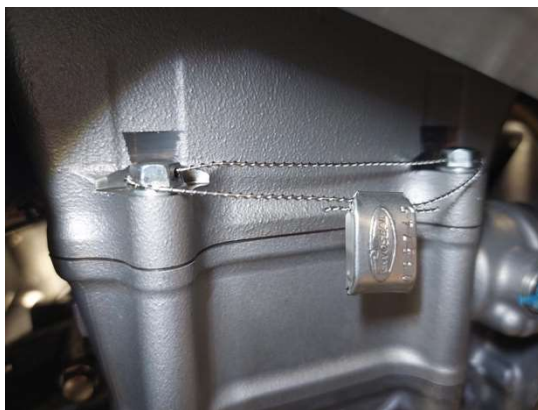
Seal cylinder/cylinder head