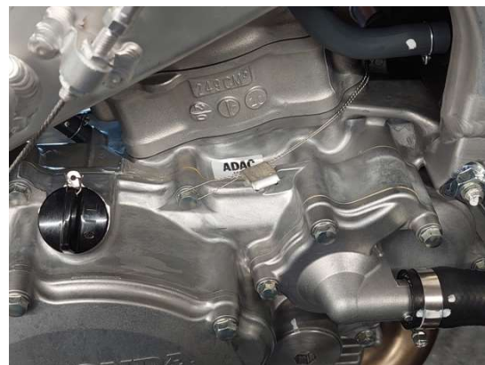
Seal engine housing/transmission cover