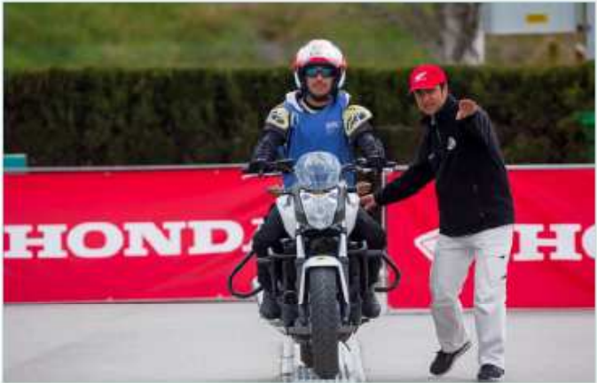
Balance & absorption: 30 MIN