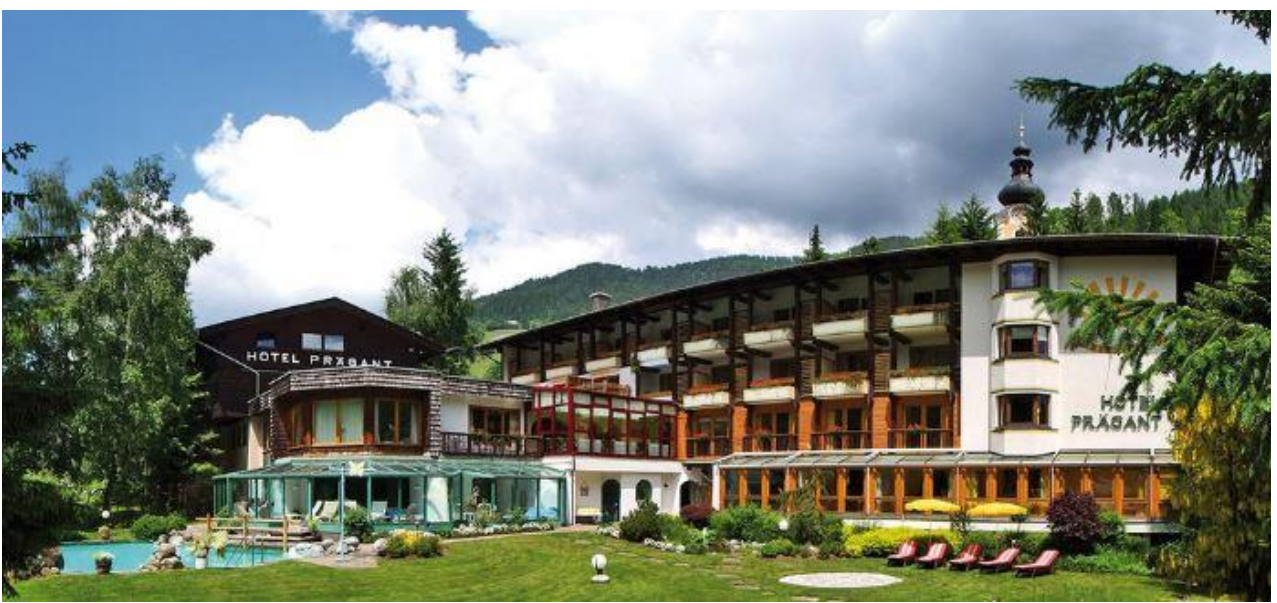
Hotel Prägant your wellness hotel in Bad Kleinkirchheim in Carinthia - Austria

24<sup>th</sup> - 27<sup>th</sup> September 2021