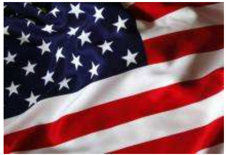
the Clipse in Stars & Stripes